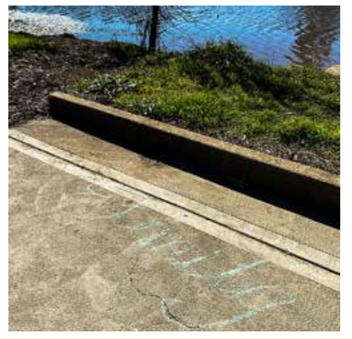
Have you seen the word 'Eternity' on your walks around Forbes lately?